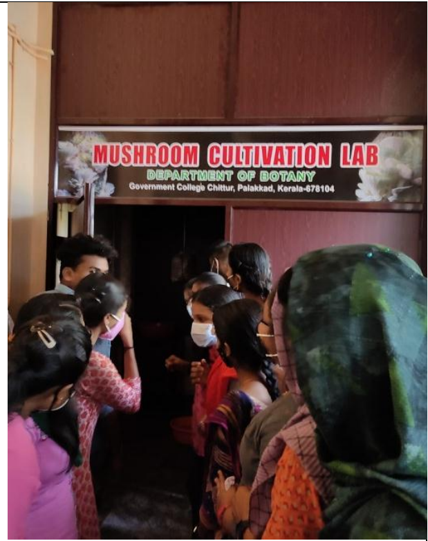
TRAINING ON MUSHROOM CULTIVATION AND PRODUCTION OF COMPOST