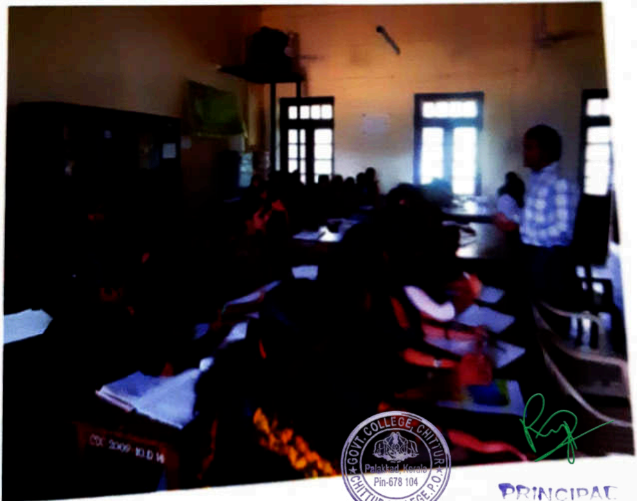
Interaction Session with students