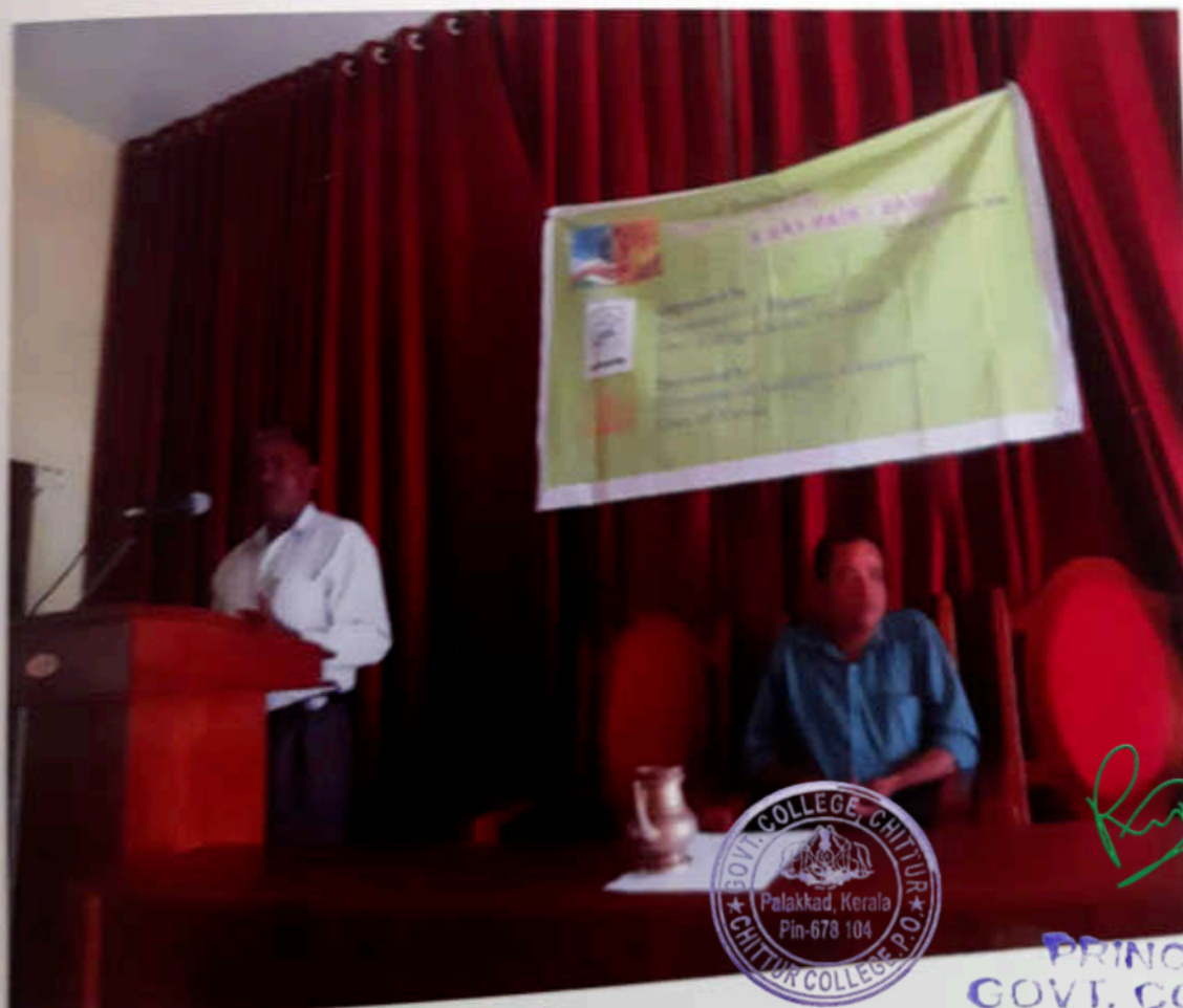
Inaugural address by Principal, Govt. College Chittur